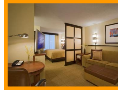
Hyatt Place King Room

From Downtown Fort Worth: Take 820 North to 121/183 East. Exit on Precinct Line Road. Turn left at the light on Precinct Line Rd. Turn left at the next light on Thousand Oaks Drive. The hotel is on the right-hand side.