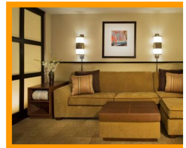
Guestroom "Cozy Corner"